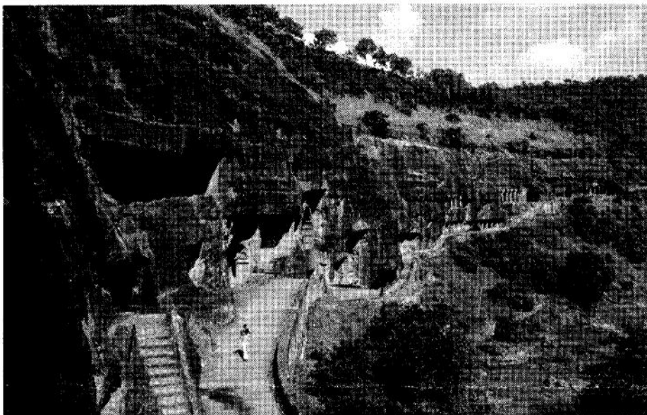
The Ajanta cliff with carved entrances; river lower right.

The Gay Buddhist Fellowship supports Buddhist practice in the Gay men's community. It is a forum that brings together the diverse Buddhist traditions to address the spiritual concerns of Gay men in the Bay Area, the United States, and the world. GBF's mission includes cultivating a social environment that is inclusive and caring.